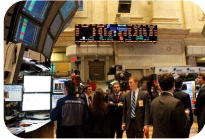
Student Managed Investment Fund